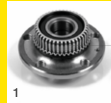
Passive impulse wheel located on wheel end

*This type of impulse wheel is difficult to identify with the naked eye and requires special care when handling and installing. Check MOOG ESB "Wheel End Bearings with integrated magnetic ABS impulse wheels" for more information