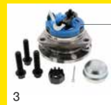
Integrated impulse wheel & ABS sensor