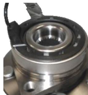
Ref. OE 96812619 R190.23