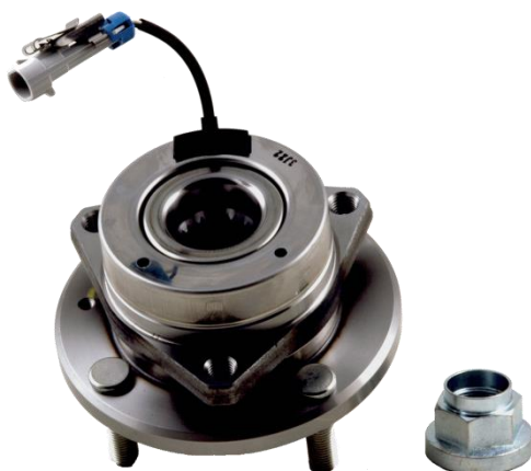
Ref. OE 96639585 R190.06

A visual inspection is required to determine which bearing should be fitted to the vehicle: the bearing with the metal cover corresponds to kit R190.06.