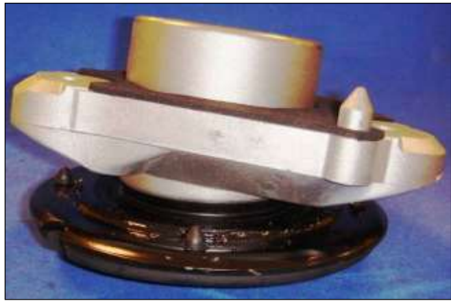
Appearance of the final assembly