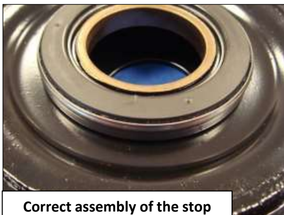
Correct assembly of the stop

Observe the direction of the stop: metallic side not visible