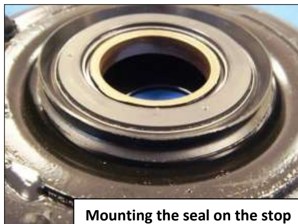
Mounting the seal on the stop