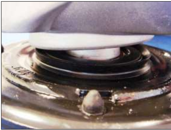
Fitting the filter block in the holder

Observe the direction of the seal: sealing lip on the filter block side