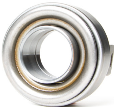
Fig. 1: Release bearings with metal housings must be lubricated

Please observe the vehicle manufacturer specifications!