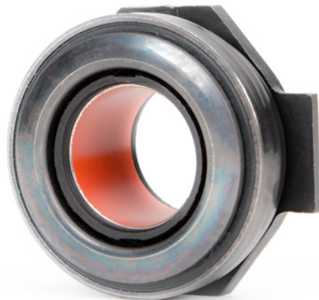
Fig. 3: Release bearings with PTFE housing must not be lubricated